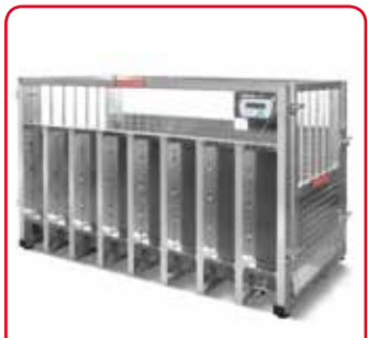
Bull scales for export weight control at Hamburg harbour