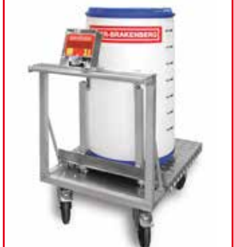
Barrel scales for chemical industry