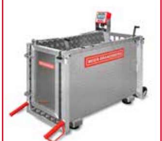
Mini piglet scales