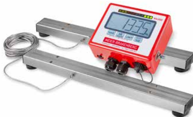
Balance beams from 100 cm in length can be shortened twice by 15 cm. Weighing beams up to 6 m long available on request.

To upgrade existing scales, we offer premium quality balance beams made of aluminium and stainless steel. The weighing electronics have an animal weighing program and the scale tares itself electronically. The weighing unit has waterproof load cells and is also protected against mice thanks to rodent resistant cables. Standard operation via mains adaptor can also be implemented with a battery.