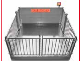
Three-way crossing at ramp