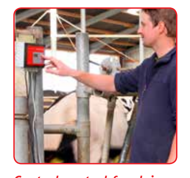
Central control for dairy farming.

The basis of low-pressure cooling is a very easy-to-install system of PVC lines and atomizing nozzles. The installation and arrangement of lines and nozzles is geared to individual conditions and air flow in the stable. Depending on the individual design, single, double or quadruple nozzles are used. Water pressure of at least 3.5 bar is sufficient for operation.