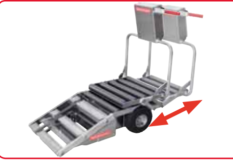
Foldable loading table for working in confined spaces. The user takes the vehicle in retracted state to the animal. The loading table unfolds while pulling the animal onto the vehicle.