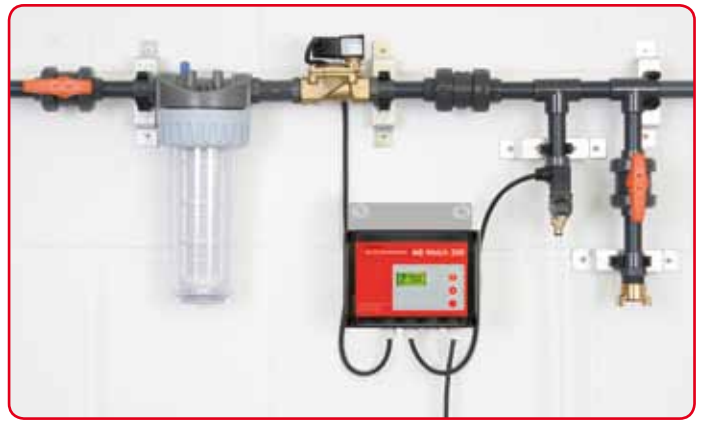
Central control unit for MBWeich 200 and filter, pressure release, disinfectant connection.